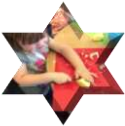
Harvesting our potatoes

The children are learning about the seaside at the moment. We would be very grateful if your child could bring in some photos/objects linked in to this for our new working wall. Perhaps they have a memory or story to tell us that links in with this theme? We would love to hear these!