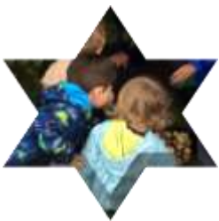
Harvesting our potatoes